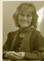
Dame Virginia McKenna Founder, Born Free

If you'd like to receive more information about planned giving, or would like to discuss your options in more detail, please call us at 301-448-1407.