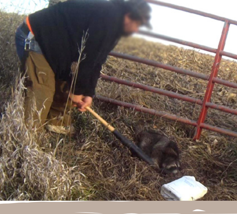
Photo: The raccoon was hit multiple times on the head and face with the baseball bat, remaining conscious throughout.

[Trapper Three] threw the raccoon several feet down the hill and [Trapper Two] once again said ‘he’s not dead’ before walking up, and demonstrated his strategy to turn them on their back and hit them in the throat. The raccoon, conscious and holding onto the bat as [Trapper Two] holds it against their chest, looked up at the people around them. [Trapper Two] swung the bat and struck the raccoon again in the side of the head. The raccoon was still visibly conscious, so he raised the bat high above his head and swung it down to hit them again. The raccoon made another audible gasp on impact and then began to spasm violently.” CLICK TO VIEW CLIP