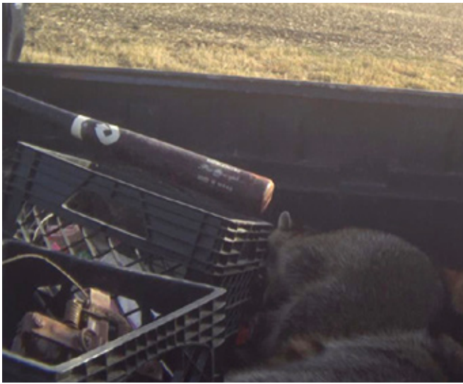
Photo: One of the raccoons was still alive. They were struck three more times with the baseball bat.