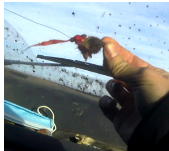
Photo: Trappers laugh as they talk about the coyote toe ripped off in a trap. They kept the toe as a souvenir.

the truck, saying, ‘I’m going to add it to your collection.’ He explained that [Trapper Two] had recently found a ‘perfect’ red coyote caught in a trap that he decided he wanted for his ‘wall of death’ (a wall in his home where he mounted his kills) and as soon as he pulled up, the coyote darted away, leaving two of their toes in the trap. Those connected toes had been placed on the dashboard and [Trapper Three] placed the newly found toe in the same spot.” CLICK TO VIEW CLIP