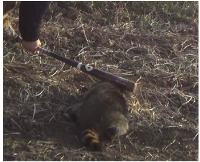
At the next stop, the raccoon was still alive. They were thrown on the ground and struck hard in the head, resulting in the animal going into violent spasm.