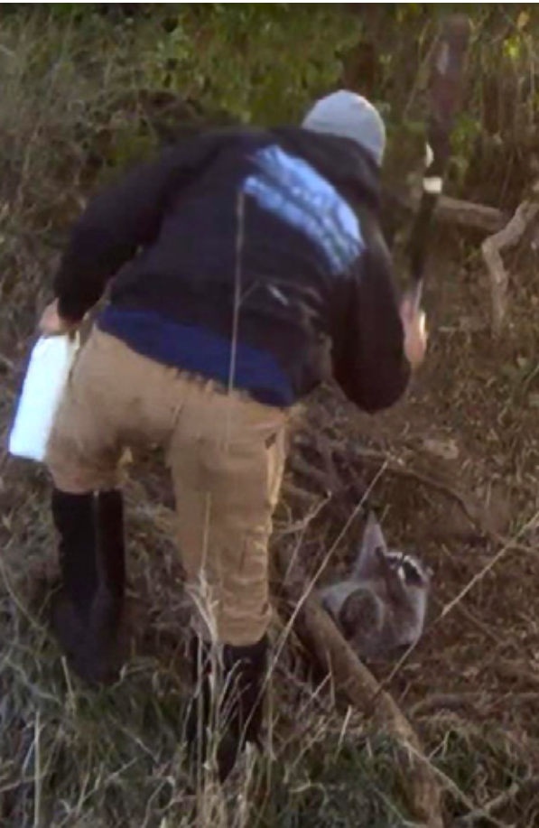
Photo: Raccoon raises their free arm and tries to struggle out of the trap as the trapper hits the animal with the bat.