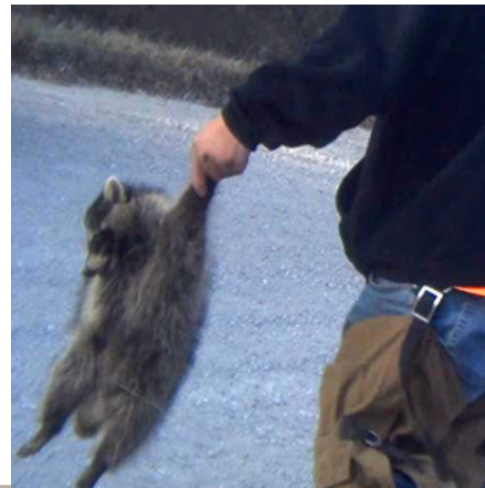
The raccoon is thrown into the back of the truck.

“While [Trapper Three] was grabbing a tool from the back of the truck, he noticed that one of the raccoons was still alive. He picked up the baseball bat and hit the raccoon firmly in the head three times. [Trapper Two] yelled at [Trapper Three] to hurry up and [Trapper Three] responded, saying he had to take a moment because ‘ Mr. Coon was standing up looking at me. ’