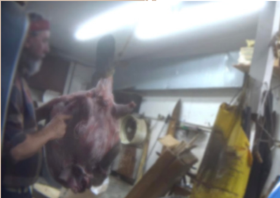
A beaver is skinned as part of the taxpayer-funded Iowa Department of Natural Resources training course.

“[DNR Conservation Officer] expanded upon the bobcat quota discussion to acknowledge that quotas are counted for each member of the family, including children, and while they couldn’t do a lot to necessarily enforce it, he hoped that if people were using their children’s’ names on tags, the kids were at least out there with them.” CLICK TO VIEW CLIP