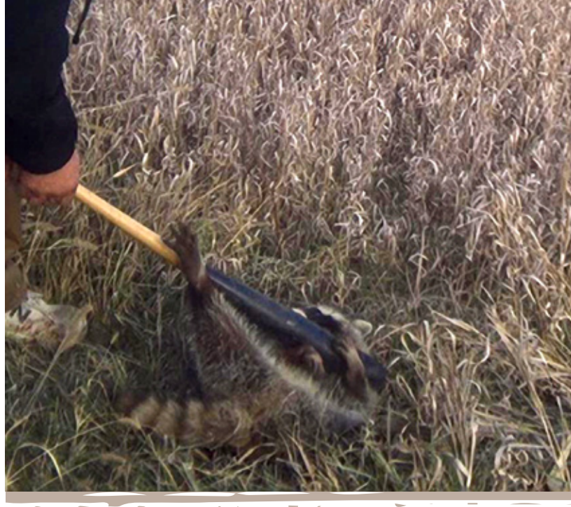
The conscious raccoon holds onto the baseball bat as the trapper brings it up to hit the animal again in the face.

“[Trapper Two] explained that a raccoon may chew their leg off if they are caught too far down toward their paw. He explained that if caught closer to their shoulder they wouldn’t be able to, but that they are liable to chew their leg off to escape if they can reach it. They said raccoons