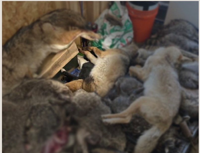
Photo: Within the large pile of carcasses in the trapper’s shed, the belly and paws of a black and white cat are visible.

“Closer to the door [of Trapper Two’s shed]... there was a pile of yet-unskinned animals, including a small black and white mammal near the bottom of the pile. He had previously sent me a photo of the same area where the animal was similarly visible. When asked what the small black and white animal was, he said ‘ that’s a cat. ’ He confirmed the cat had been caught in a trap.”