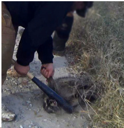
Failing to kill the raccoon with the first blow, the trapper stepped on their neck, then repeatedly hit the animal in the face and throat with the bat.