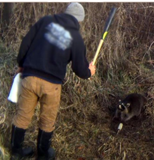
Photo: Raccoon looks up at trapper before being hit in the head with a baseball bat.