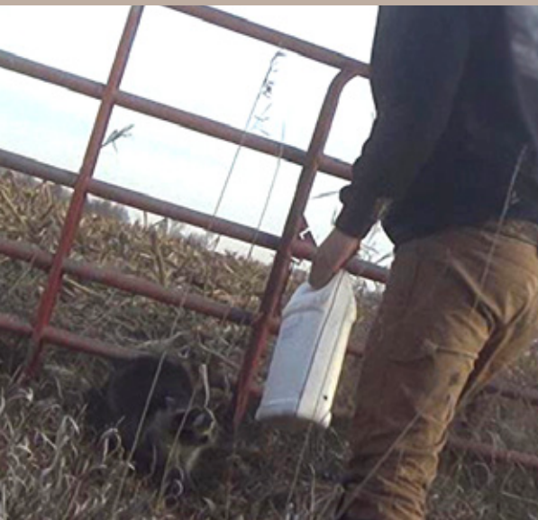
Photo: Raccoon caught in a leg-hold trap looks up at the trapper as he raises his baseball bat.

Caution: Graphic descriptions of animal suffering and cruelty.